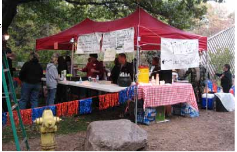
The Springbrook Foundation runs the food tent at the popular Pumpkin Night in the Park. An all-volunteer staff keeps the prices low and money raised helps the Nature Center.

The Board wants to thank contributors MoJo’s Pizza of Fridley and Cub Foods of both Northtown and St. Anthony. The Board also thanks Food Tent patrons and suggests they patronize the above local businesses. Next year plan to