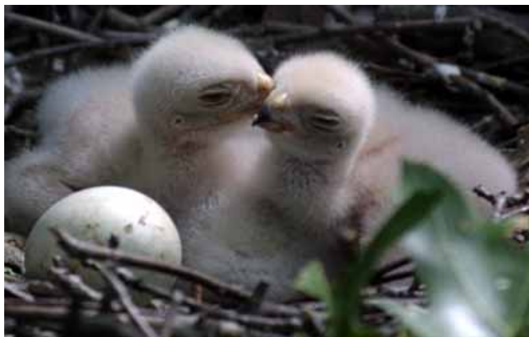
The Foundation tried to bring the early lives of a pair of Coopers hawks to video, but safety for the birds won out.

Well, the hawks won! Before the camera system was debugged, the chicks were “branching,” threatening to fly off prematurely, in grave danger of falling to the ground. Mama hawk became frantic at each photo shoot. Siah said: “Time to